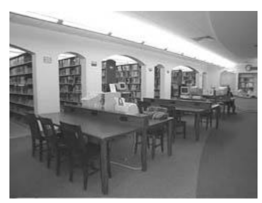
Adult bookstacks with computer tables

An open stairwell to the second floor leads to a café and audiovisual materials. The children's room, which contains window seats built into dormers and separate story and craft areas, is on the second floor above the adult and young adult areas. The technical services area is located above the meeting room. More than a dozen dormers provide light to the second floor. Natural woods and neutral tones accented with shades of blue create a peaceful atmosphere throughout the library.